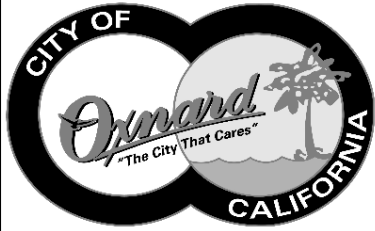
EXHIBIT " A "