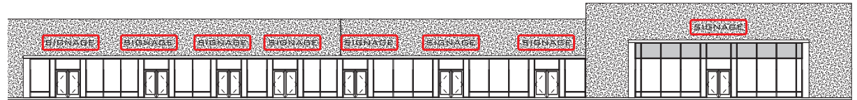
NORTH ELEVATION - WEST