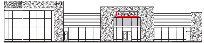
NORTH ELEVATION - EAST