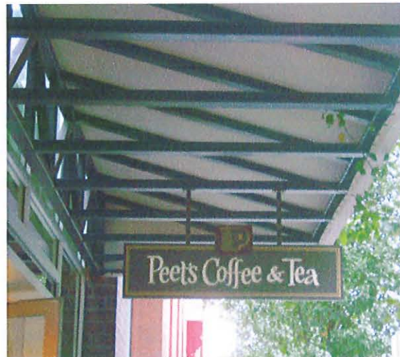
Hung Sign at Canopy