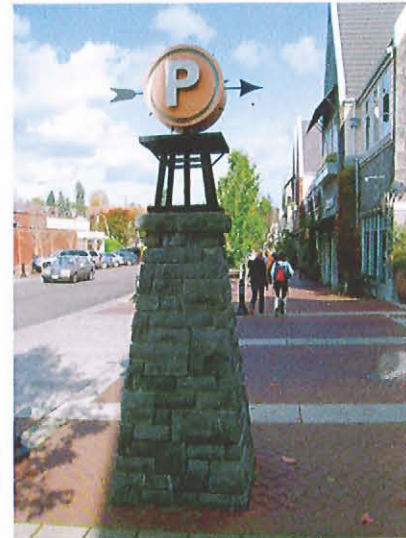
Public Parking Entry Signage