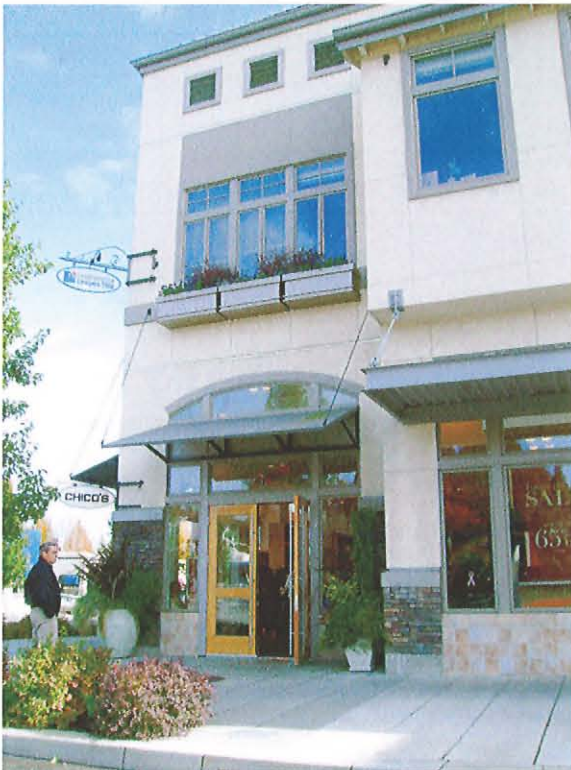
Corner mounted signage