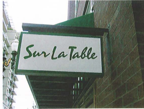
Pole sign under canopy